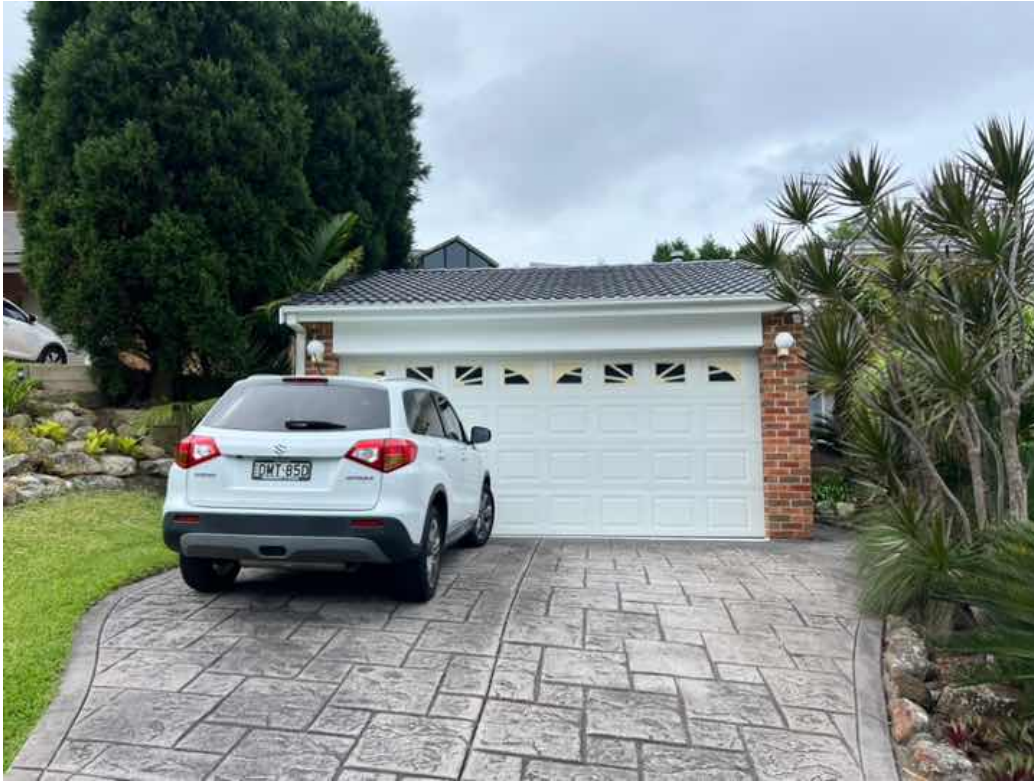
Roof Tile roof